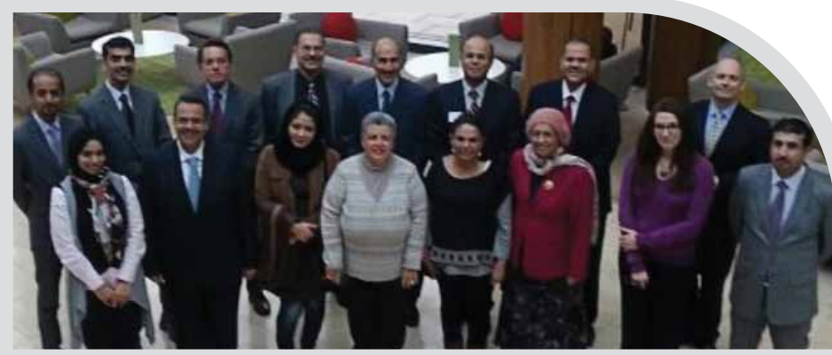
The Council of Commissioners Participates in The Intensive Training Program for Capacity Building in The Field of Human Rights in The United Kingdom

By virtue of Law No. 52 for the year 2006, the Kingdom of Bahrain became a party to the International Covenant on Civil and Political Rights had reservations to Articles 3, 18, 23, 9/5 and 14/7. The Kingdom of Bahrain also joined the International Covenant on Economic, Social and Cultural Rights (ICESCR) by virtue of Law No. 10 for the year 2007 and had reservations to Article 8 d (1). Bahrain did not join